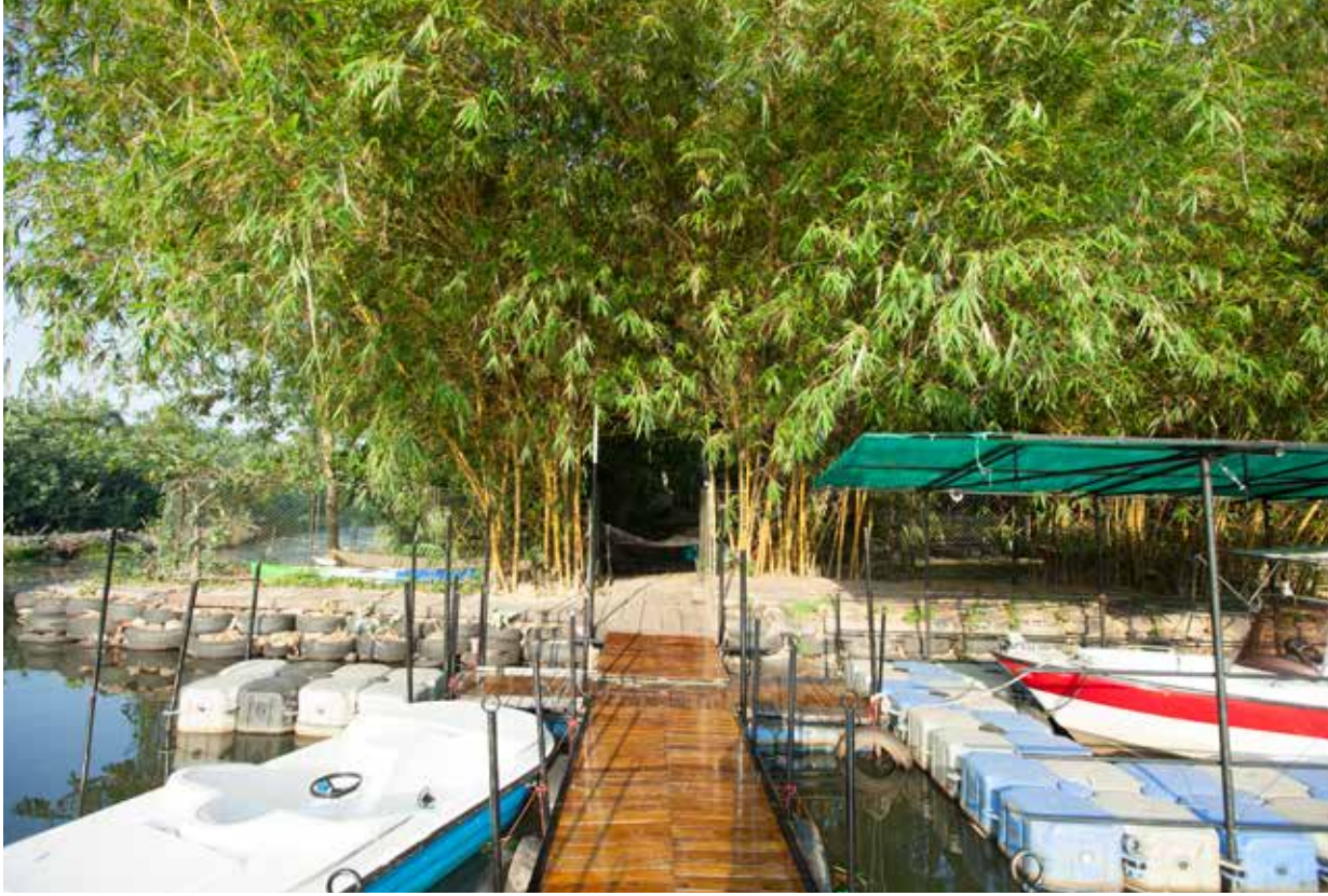
Top: capturing the nature through openings; bottom, left and right: the wooden walkway from