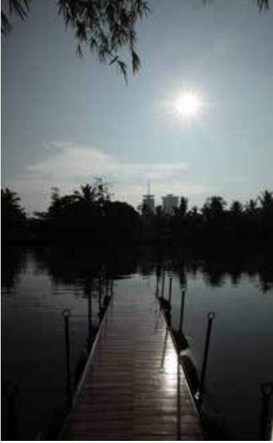
the jetty of the lake to the house and the aquatic environment around the house